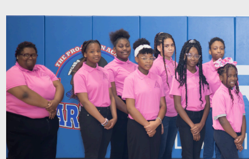
S.H.E Program (Strong, Healthy, and Empowered)

Pro-Vision, Inc. continues to provide young people with the guidance and tools to realize their full academic, economic, and social potential. The Character Development Program is anchored by the Manhood Development Program and S.H.E. (Strong, Healthy, and Empowered). It develops character and integrity by combining close mentoring relationships with exposure to situations reinforcing moral and ethical thinking. The Job Enterprise Academy allows participants in the Manhood and S.H.E program to intern with well-known Houston-area companies and at the Pro-Vision/McNair Urban Farm. The program is designed to prepare young men and women, ages 16 and older, for success in the workplace by providing them with real-life, professional workplace experience, a critical component to developing young people holistically.