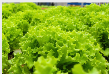
Red Oak Leaf