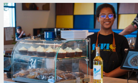
JEA (Job Enterprise Academy)