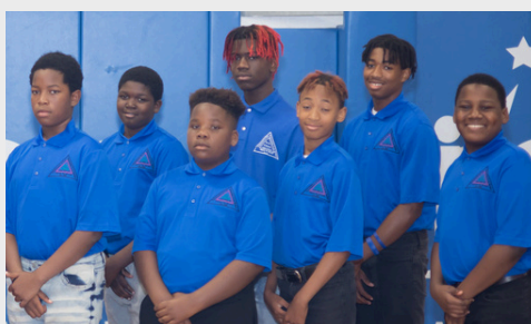
Manhood Development Program